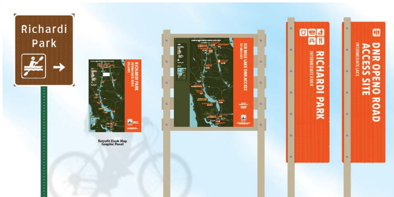
Examples of the water trail signage which will be placed at access sites along the Chain of Lakes Water Trail

Our next steps will be to install signage at all access site, make information more readily available including a waterproof guide and promote our great asset and communities.